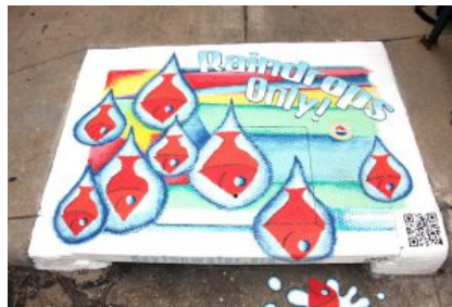
Art: Stu Halfacre and John