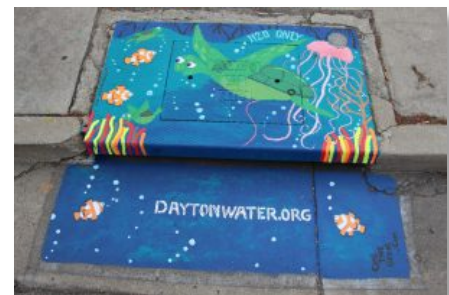
Art: Camille Karunaratne