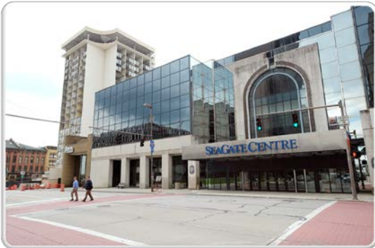
SeaGate Convention Centre Site of 2018 Ohio PWX

The Ohio Public Works Expo is a showcase each year of creative problem-solving, groundbreaking technologies, and innovative strategies in management, design, operations and customer relations. The low cost of only $75 will give you full access on Thursday, June 21, to the equipment display area ( 50,000 sq. ft. ) and all technical sessions. Breakfast and lunch are included as well. It's a conference packed full of equipment displays, technical sessions, vendor demonstrations and colleague networking.